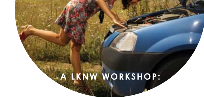
A LKNW WORKSHOP: